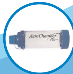
AeroChamber Plus* VHC with mouthpiece