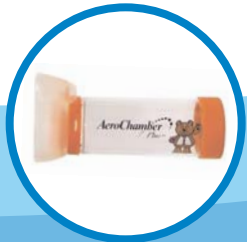
AeroChamber Plus* VHC with infant mask