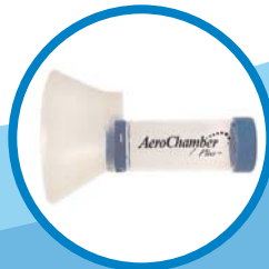
AeroChamber Plus* VHC with adult mask