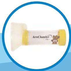
AeroChamber Plus* VHC with child mask